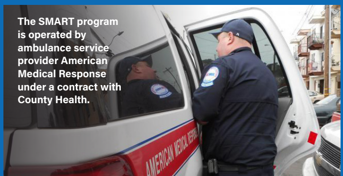
The SMART program is operated by ambulance service provider American Medical Response under a contract with County Health.