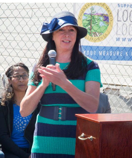
The new Brisbane Library was dedicated to the community on Oct. 24, 2020.

South San Francisco Grand Avenue (renovations)