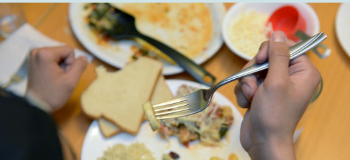
Emergency loans help families keep food on the table

$14.9 MILLION MEASURE K FUNDS toward affordable housing projects in the 2018-19 fiscal year