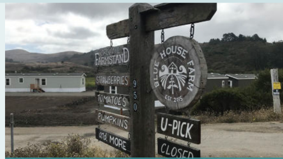
Blue House Farm with new housing in the background

POST awarded a long-term lease on the property to Blue House Farm, which grows a variety of organic fruits, vegetables and flowers. Blue House Farm, in turn, worked with POST, the County and other stakeholders to build the infrastructure and the new homes for farmworkers.