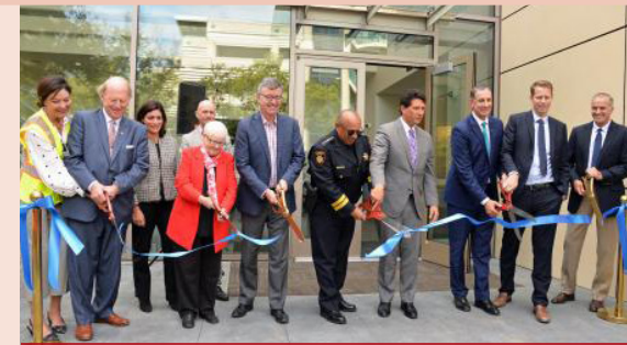
ROC Ribbon Cutting

The two-story, 37,000-square-foot ROC is designed to withstand and remain functional during and after a major earthquake. Independent power generators and water systems will allow first responders and support personnel to operate "off the grid" for up to a week.