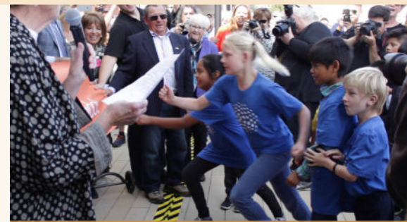
New Half Moon Bay Library opens its doors

NEW CONSTRUCTION, RENOVATIONS OR PLANNING for library projects in Brisbane, Half Moon Bay, Pacifica, Redwood City, Daly City, South San Francisco, East Palo Alto and San Mateo