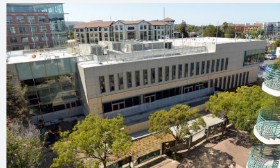
Work on the County's new Regional Operations Center, or ROC, was substantially completed during the 2018-19 fiscal year. The 37,000-square-foot ROC will become the County's hub for disaster planning, response and recovery.

Based on initial performance data, 155 of a total of 227 performance measures achieved targets during the fiscal year, or 68.28%. Seventy-two performance measures, or 31.72%, did not meet targets or were in data development.